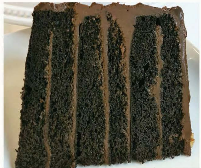
6 layer Chocolate