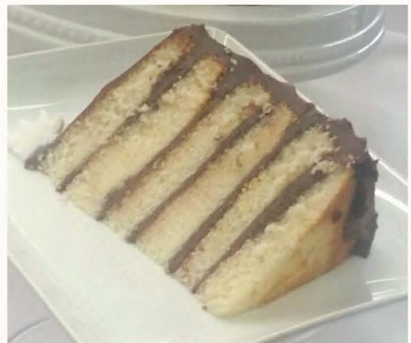
Six Layer Yellow