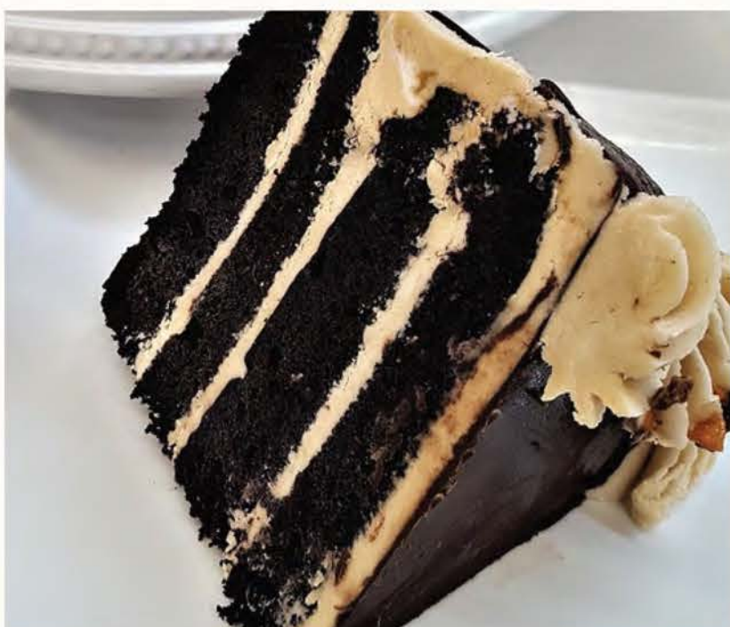
Peanut Butter Delight